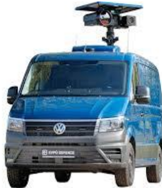
Fig 1 Smart video surveillance

such as Arduino microcontrollers, solar energy, and wireless communication systems to create an efficient, low-cost, and environmentally friendly approach to campus surveillance and communication.